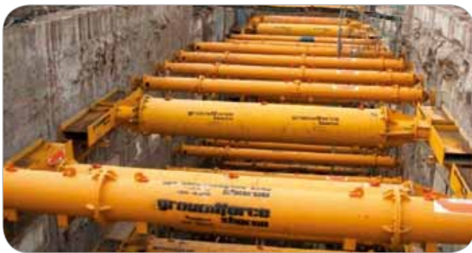
North Cut and Cover Section

Here the trench for the tunnel approach is 12.5m wide and varies from 14m to 20m in depth. The depth of the excavations and the poor soils encountered on both sides of the river generate extremely high loads on the 1m thick diaphragm retaining walls. An extremely stringent set of loading criteria was specified by the engineers for the temporary support system. In addition to the primary load due to ground pressure, additional load effects included; load due to a potential loss of prop situation arising, 50kN of applied accidental load and a potential 38°C rise in ambient temperature.