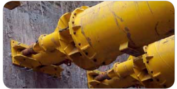
MP500 Hydro-mechanical Props

Fixed length non-hydraulic props were also designed to support the most heavily loaded areas and also the two transition chambers located immediately on each side of the river. These chambers will eventually be flooded to enable divers to break through into the submerged tunnel sections thus linking the tunnel under the river to the approach sections. The south transition structure is 30m deep and required individual prop loads of up to 1,400 tonnes, steel tubes up to 1m in diameter were needed to accommodate these large loads.